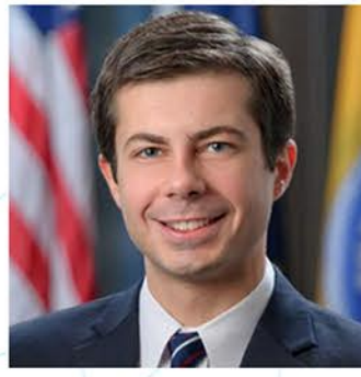
Pete Buttigieg Mayor City of South Bend