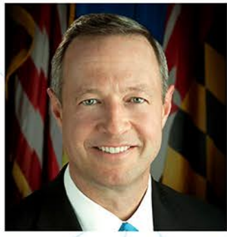
Martin O'Malley Chair of MetroLab Network 61st Governor of Maryland 47th Mayor of Baltimore